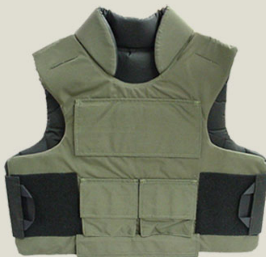
TROJAN TACTICAL BODY ARMOR (8470) WITH COLLAR AND GROIN PROTECTION PART NO. DHK80012-KBPV-3A NIJ LEVEL IIIA PROTECTION CARDURA NYLON OUTER SHELL OD GREEN, WOODLAND CAMO, NAVY, TAN WEIGHT-2.90kg (6.4lbs) SIZES:SM,M,L

Like all our jackets, the BPJ has all the quality touches you expect from DHK such as double needle stitching for strength; bar-tacked ballistic panels and reinforcement in the areas most vulnerable to excessive wear. The lightweight bulletproof jacket is convenient and comfortable to wear and should not impede the movement of the wearer in carrying out various operational duties in the field.