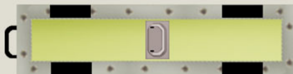
Occupant Feet Resting Area Ballistic Protection NIJ Level III Protects against 7.62 mm and IEDS (Level IV protection available if required) Part # DHK700213-OFRA-3