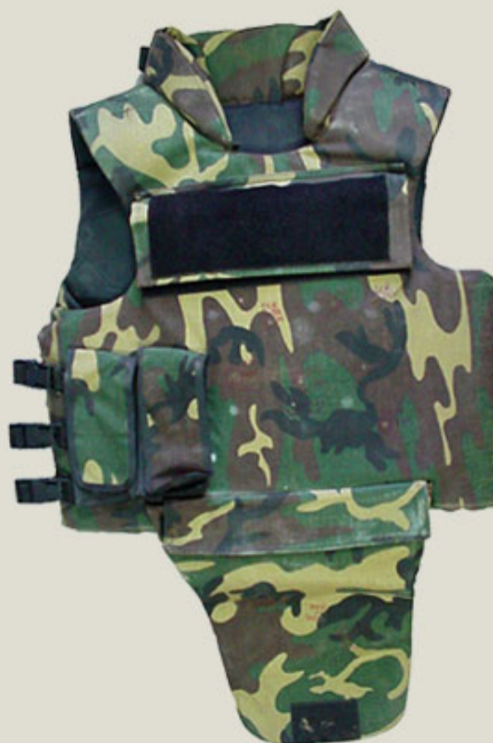
TROJAN ULTRA-LIGHT BODY ARMOR, RDV-3A PART NO. DHK80013-RDV-3A NIJ LEVEL IIIA PROTECTION CARDURA NYLON OUTER SHELL OD GREEN, WOODLAND CAMO, NAVY, TAN WEIGHT-2.90kg (6.4lbs) SIZES:SM,M,L