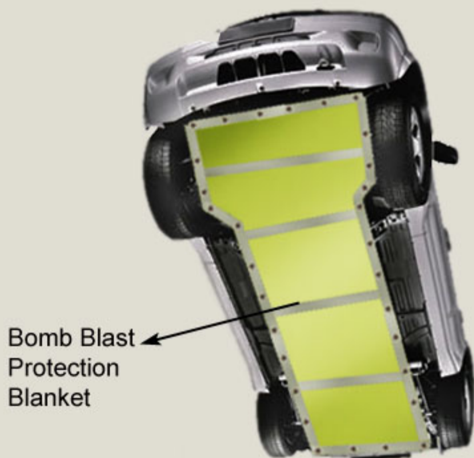
Bomb Blast Protection Blanket