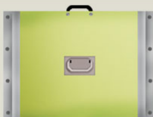
DHK Ballistic Protection Panel NIJ Level III Protects against 7.62 mm and IEDS (Level IV protection available if required) Part # DHK700213-BPP-3 or 4